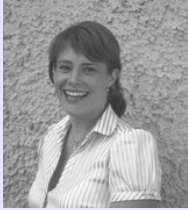
Project manager Business Region Göteborg