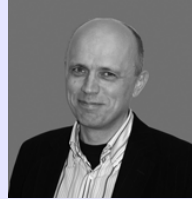
Export developer Skaraborg