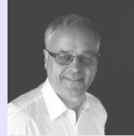
Export developer Fyrbodal