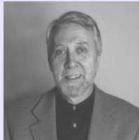
Export co-ordinator Scandinavia