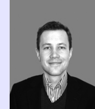
Export developer Göteborgsregion